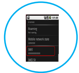
Corporate IMEIs read into corporate system