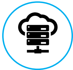
Shared Information pool on exiting IMEIs