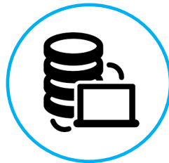
Search & Monitor company IMEIs